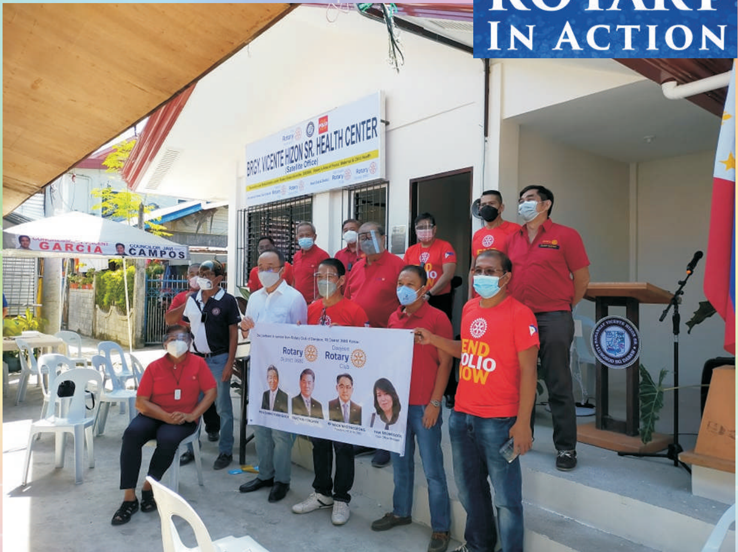
July 27, 2021 FORMAL TURNED-OVER OF BARANGAY VICENTE HIZON SR. HEALTH CENTER (SATELLITE OFFICE) Project under Global Grant No. 2092854, Rotary's Area of Focus: Maternal & Child Health International Partner Club & District: Rotary Club of Daejeon, Rotary International District 3680 Korea, Host Club & District: Rotary Club of East Davao, Rotary International District 3860, Philippines, this project was made possible in part by a grant from: The Rotary Foundation of Rotary International