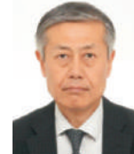
Hon. Yoshiaki Miawa Consul General of Japanese Consulate Office in Davao City