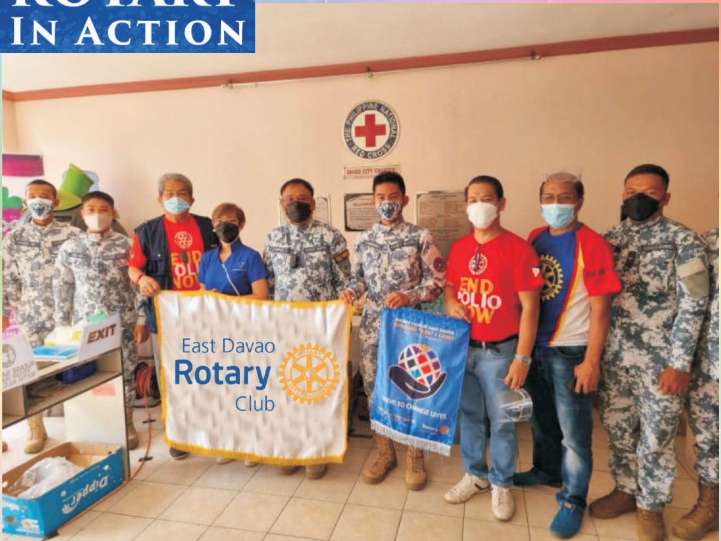
July 28, 2021 Rotary Day of Service: Bloodletting Activity, Rotary's Area of Focus: Disease Prevention and Treatment, A joint project of the Area 2 Rotary Clubs (Davao City) in partnership with Philippine Red Cross Davao Chapter, Partners in Service (Blood Donors): Coast Guard District Southeastern Mindanao (CGDSEM)